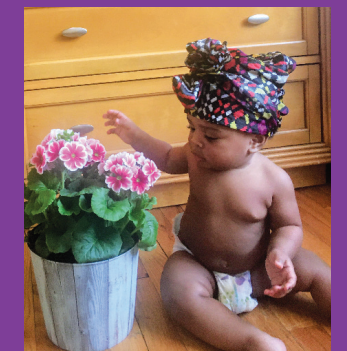
Zuri, 29 weeks