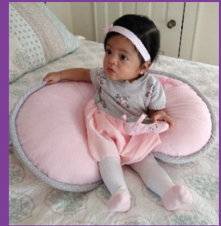
Emma born 28 weeks