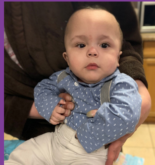
Legend born 26 weeks