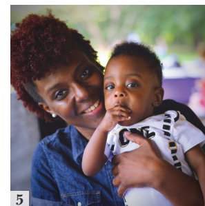
Children and adults alike enjoyed the afternoon