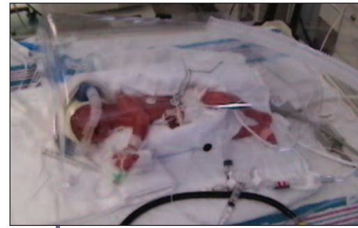
Taryn at birth.