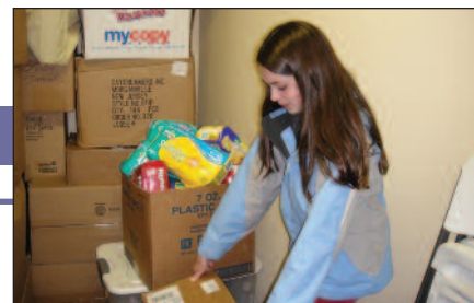
A New Canaan Country School student volunteer helps move supplies for deliveries to hospitals.