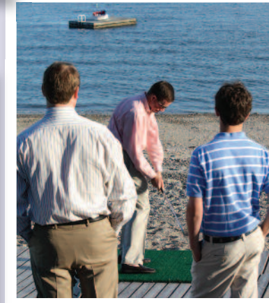
Great weather encouraged a lively golf competition.