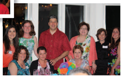
Bridgeport Hospital Foundation friends, neonatal nurses and TTMF mentors gathered for a team photo.