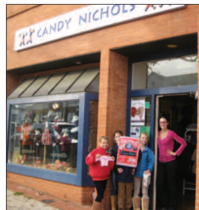
Students from New Canaan Country School donated their time to hang posters for TTMF's Cirque Voila fundraising event.