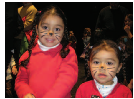
Above left: Families enjoy VIP hour prior to the circus. Left: Face painting fun.