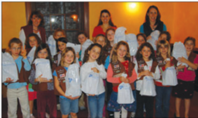
Brownie Troop 50393 from Holmes School proudly shows off some of the Welcome Bags they assembled.