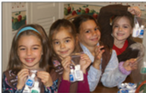
Brownies from Hindley and Royle Elementary Schools worked together to assemble supplies which went in "Tiny Treasures" Home Care Bags.

A donation of $50 could provide "Tiny Treasures Welcome & Homecare Supply Bags" to two families!