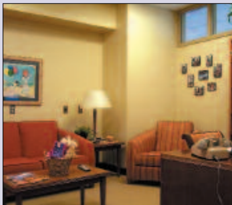
Stamford Hospital's Resource Room

When The Tiny Miracles Foundation's original Stamford Hospital Resource Room was needed for cardiac ICU medical space, the Stamford Hospital NICU and TTMF teamed up to create an even better sanctuary for NICU families. The hospital relocated and enlarged the room, making it more comfortable and convenient. TTMF then decorated the room, donating the furniture, rug, flat screen TV/DVD, computer, printer and artwork, as we had recently done at Norwalk Hospital. Both are now beautified and improved havens for NICU families. ♥