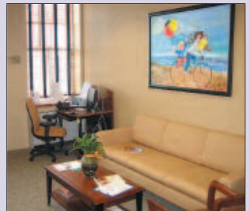
Norwalk Hospital's Resource Room