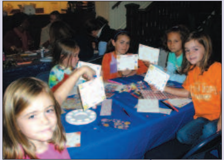
Students and parents from New Canaan Country School made over 100 frames for incubators, and several tiny knit hats during the school's Family Community Service Day.