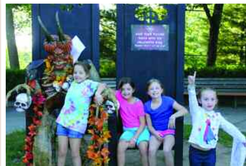
Some young friends from Weston enjoyed themselves at the zoo!