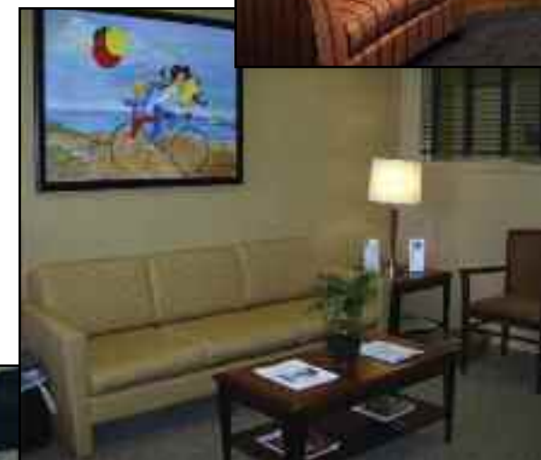
Norwalk Resource Room