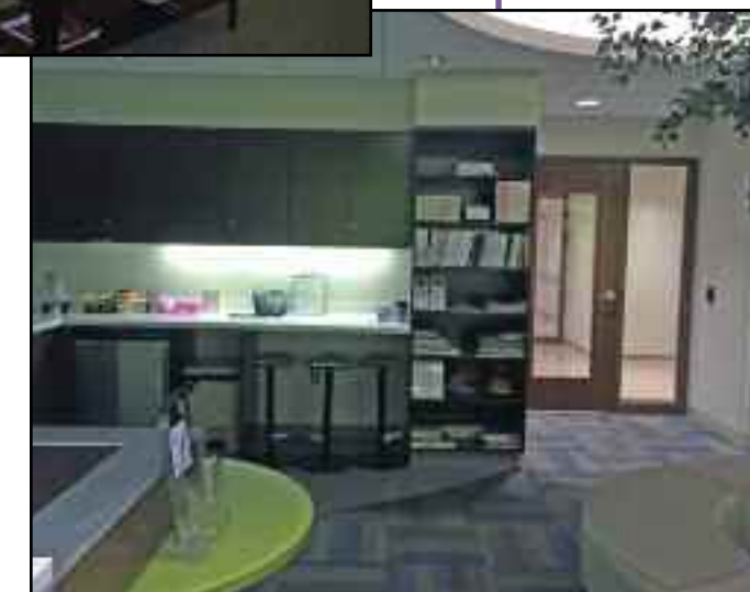
Danbury Resource Room