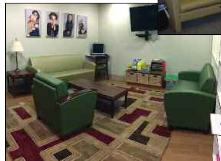
Bridgeport Resource Room