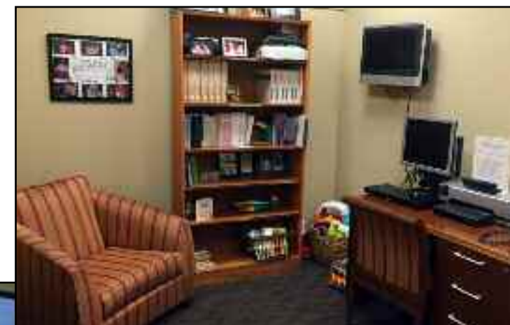
Stamford Resource Room

The Resource Rooms are one of Tiny Miracles most appreciated programs. The emotional boosts they provide are immeasurable and parents are so grateful for them! ❤️