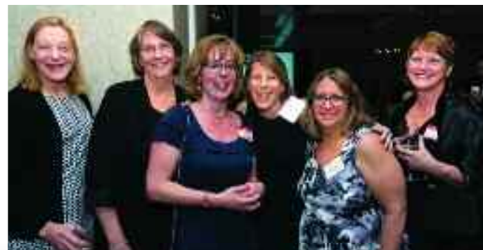
NICU staff from Norwalk and Danbury Hospital